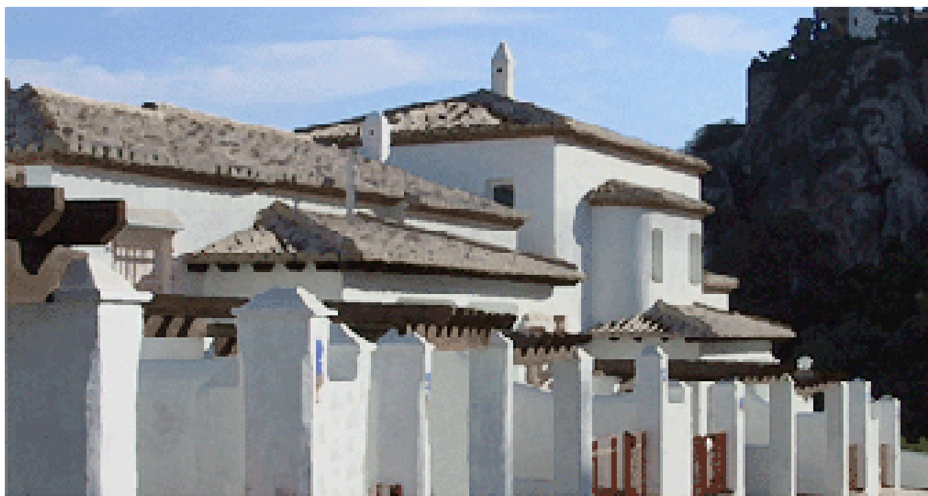
Manipulated image with the unwanted details removed using the Rubber Stamp Tool. The dark gate post where the reflected light was obstructed by a vehicle has been lightened.

these will vary depending on the subject. Here I settled on 'Brush Size' - 1, 'Brush Detail' - 10, 'Texture' - 1; then repeated it. I liked this amount of manipulation.